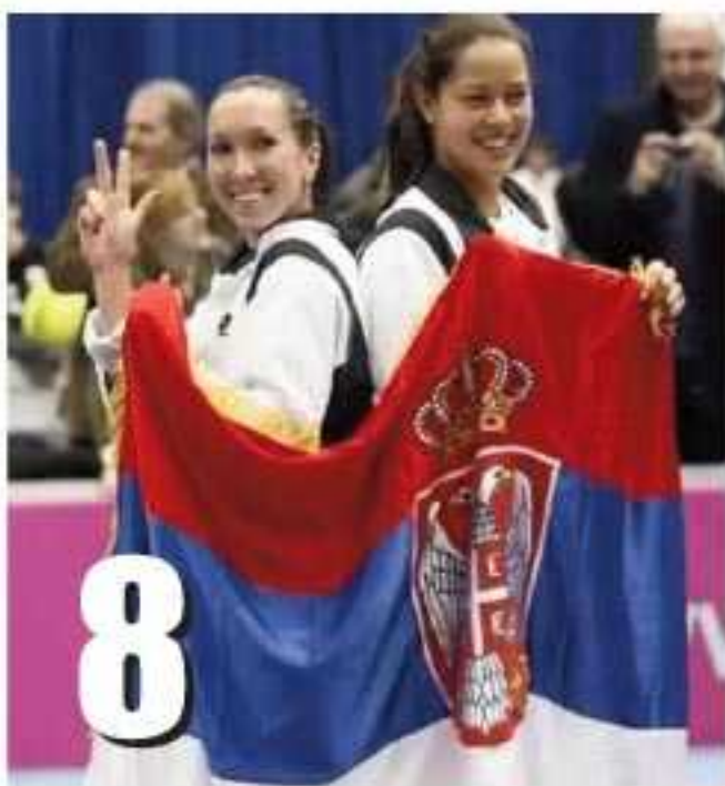
HISTORY OF STF Tennis is the way of live in Serbia.