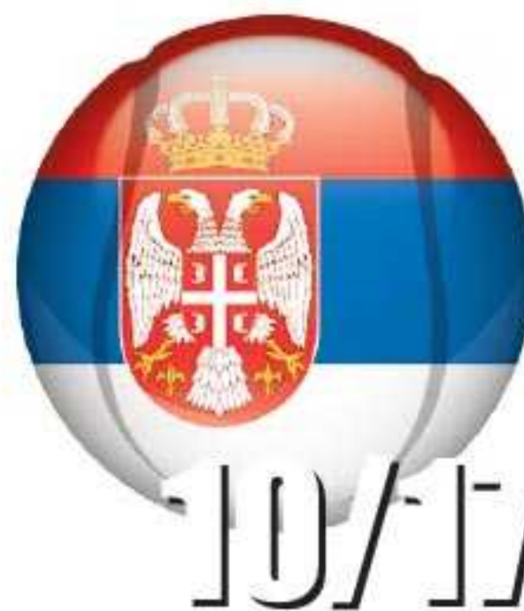
THE WORLD CUP OF TENNIS Billie Jean King Cup 2023 Finals