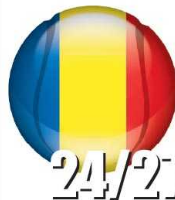
DRAW BOARD The official draw ceremony will be held on November 9